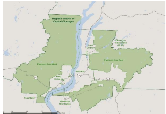
Areas impacted by Zoning Bylaw No. 871