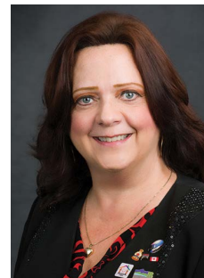
Cindy Fortin Mayor, District of Peachland