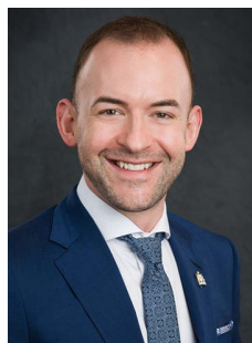
Loyal Wooldridge Councillor, City of Kelowna