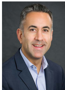
Colin Basran Mayor, City of Kelowna